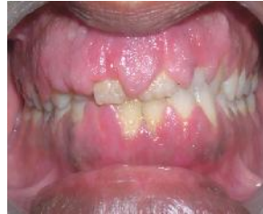
Fig 1: Preoperative view

gain of adequate functional ability. Esthetics was significantly improved in terms of gingival appearance after surgical excision of enlarged gingival tissue. Patient was put in follow-up programme at 1, 3, 6 months interval followed by after 1 and 2 years. There was no recurrence of the disease even after two years follow up.[fig.5]