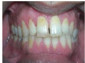
Fig 5: Post-operative 2 years