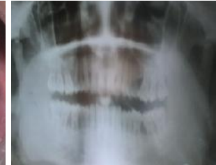
Fig 2: Orthopantomogram of patient showing loss of alveolar bone