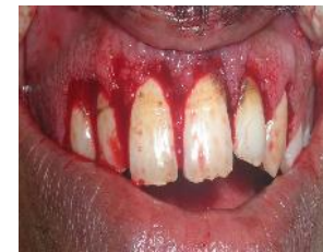
Fig 4: Intra-operative view