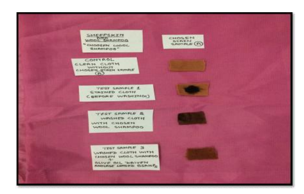
Fig 2: Washing results of stained woolen fabric pieces having chosen stain sample A of shoe polish (Cherry Blossom Shoe polish Black) with chosen wool shampoo named, Wool Shampoo for Sheepskin and Wool Products and prepared bio-active olive driven amylase loaded BSANPs[15]