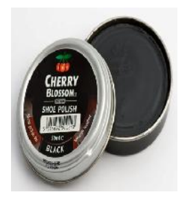
B: Chosen stain of Shoe Polish