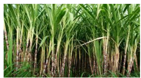
Fig1: Photograph of Sugarcane (Saccharum officinarum)