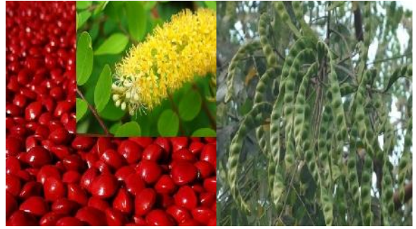
Fig 1: Seed, flower and pod of Santalum rubrum

The aim of current study was to analysis the ethanolic extract of Santalum rubrum seed by UV & FT-IR along with phytochemical screening to get knowledge about the functional groups present in various secondary metabolities in this important medicinal plant. This will serve the knowledge about the justification of medicinal uses of seeds of this plant.