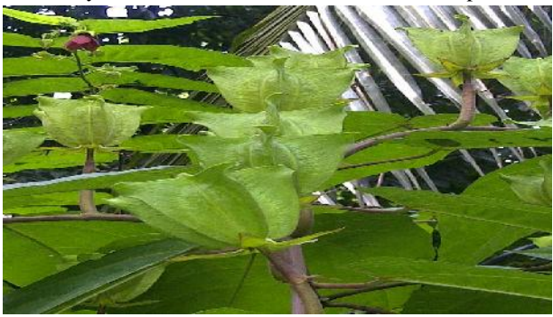
Fig 1: Leaf of Abroma augusta

present on short stamina tube.F ive staminoides are present. Capsules are almost 4 cm. Long, obpyramidal, membranous finally pubescent, and truncate at the apex. Capsules are thrice as long as the persistent calyx. Each carpel has a triangular wing behind it. Flowering and fruiting occur in December and January. Seeds are small, blackish, covered with silky hairs<sup>.1, 2, 3.</sup> The leaves are shown in picture 1.