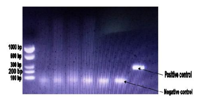
Fig 2: Negative band of HPV Oncogenic by PCR Amplification.