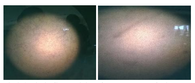
Fig.3 Anti bio film activity of Prunus avium fruit extract in Crystal violet assay

Bio film inhibition studies carried out using plant extracts have successfully inhibited bio film formation of E.coli . The plant extract inhibited bio film as dose dependent manner. The results were presented in Table 1.