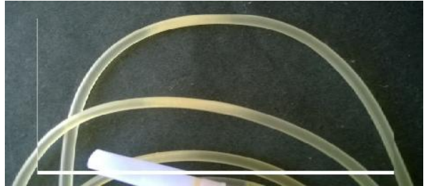
Fig 4: Escherichia Coli bio film in Urinary Catheter.

Prunus avium fruit extract was injected into the catheter coated with bio film of Escherichia coli and observed for a period of 15 days. There is a significant decrease in the intensity of the bio film of Escherichia coli after a period of 3 days (Fig 4, Fig 5).