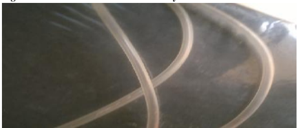
Fig 5: Effect Prunus avium fruit extract in prevention of Escherichia Coli bio film in Urinary Catheter.