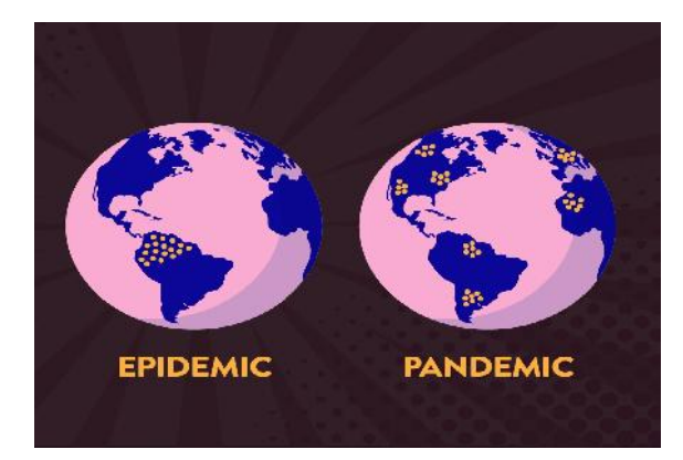
Fig 1: Difference between epidemic and pandemic 2. EPIDEMIC

Epidemics is described from two Greek words epi "upon/above", demos "people/population"[9].